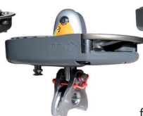
HR 3:1 friction sheave