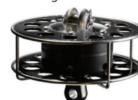
Single line drum