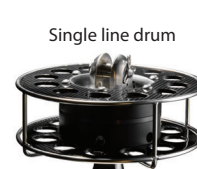
Single line drum