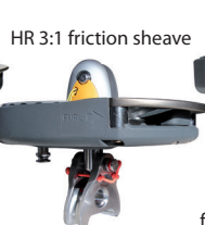
HR 3:1 friction sheave