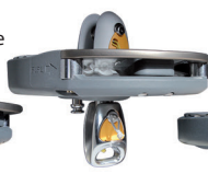
Quick release 3:1 friction sheave (NEW)