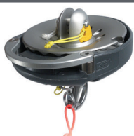
Drum with its fitting