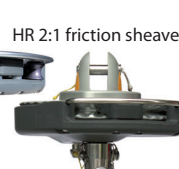
HR 2:1 friction sheave