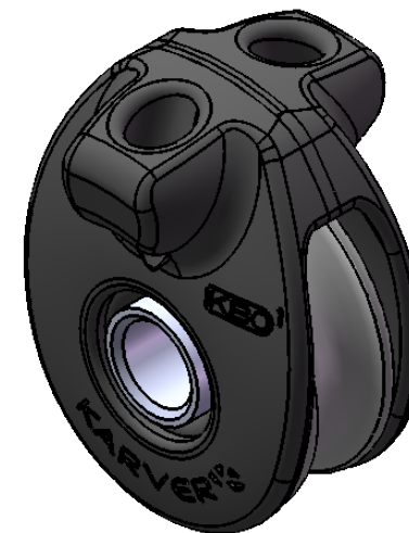
Balls-bearing block Poulie à billes