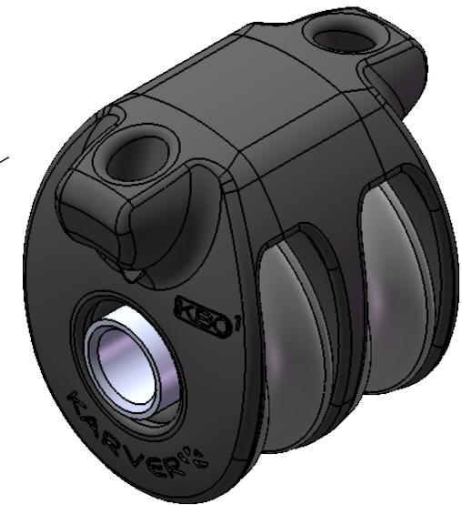
Balls-bearing block Poulie à billes