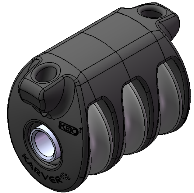
Balls-bearing block Poulie à billes